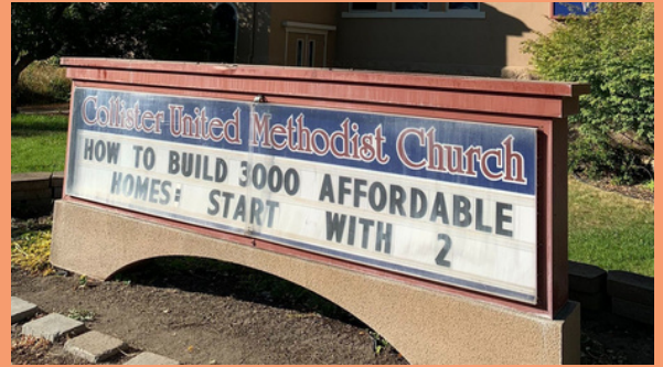
Sign out front of Collister United Methodist Church, partners of Taft Homes.