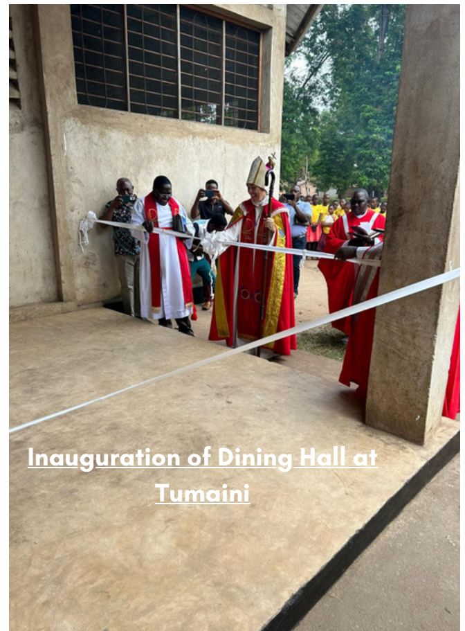
Inauguration of Dining Hall at Tumaini