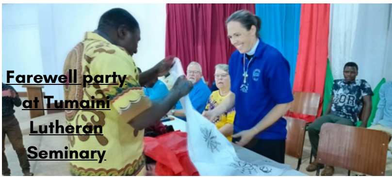
Farewell party at Tumaini Lutheran Seminary