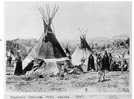
A Shoshone encampment in the Wind River Range of Wyoming

In 2008 the Northwestern Band of the Shoshone Nation acquired the site of the Bear River Massacre and some surrounding land. They wanted to protect the holy land and to build a memorial to the massacre, the largest their nation had suffered. In partnership with the American West Heritage Center and state leaders in Idaho and Utah, the tribe has developed public/private partnerships to advance tribal cultural preservation and economic development goals. They have become leaders in developing tribal renewable energy.