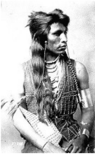
Rabbit-Tail or Moragootch

The Shoshone as a Native American tribe originated in the western Great Basin and spread north and east into present-day Idaho and Wyoming. By 1500, some Eastern Shoshone had crossed the Rocky Mountains into the Great Plains. As one of the first northern tribes to incorporate horses and firearms into their economy, hunting and warfare, the Shoshone nation became a dominant